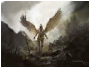
An artist impression of an angel on earth