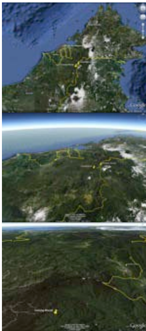
Overview of where Ba Kelalan and Mr Murud is