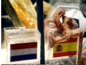
Paul the Octopus