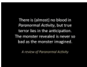
Paranormal Activity – the movie, a critic’s quote