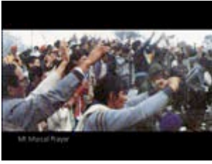
Mt Murud Prayer (near Ba Kelalan) during the early days