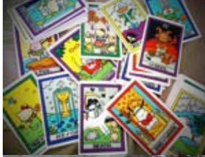
Hello Kitty Tarot Cards