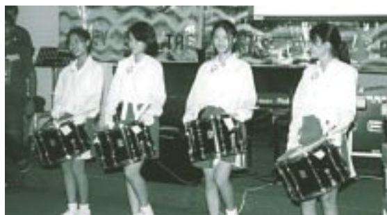
During the Opening Ceremony