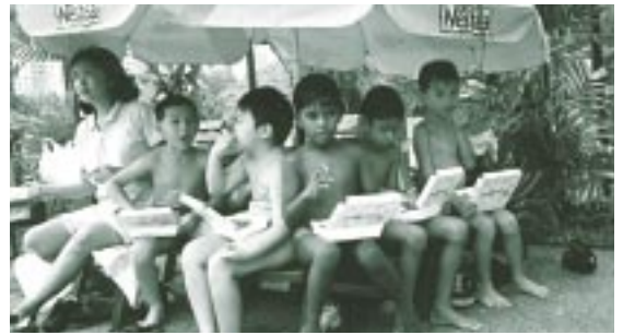
At Desa Water Park