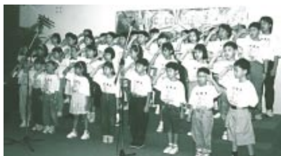
The Children's Choir introducing the VBS theme song