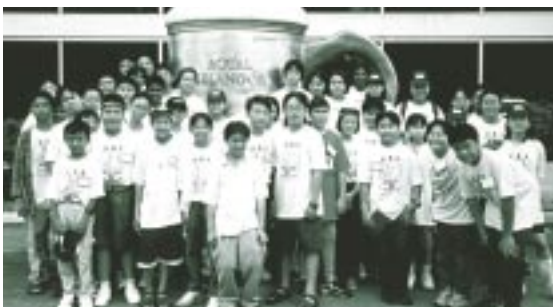
At the Royal Selangor Pewter factory