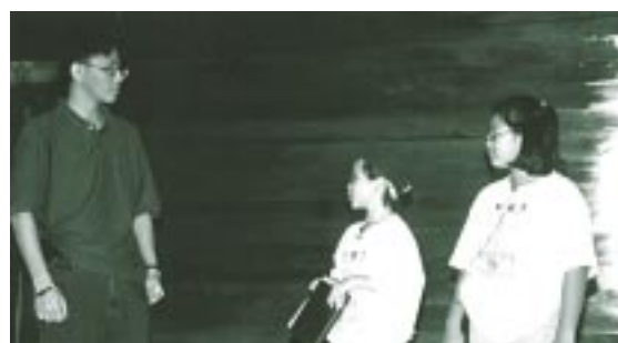
The older children watched skits at the Sanctuary