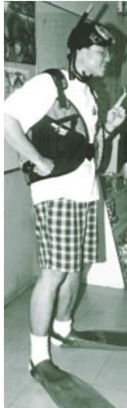
The extent the teachers went to make their lessons clear!