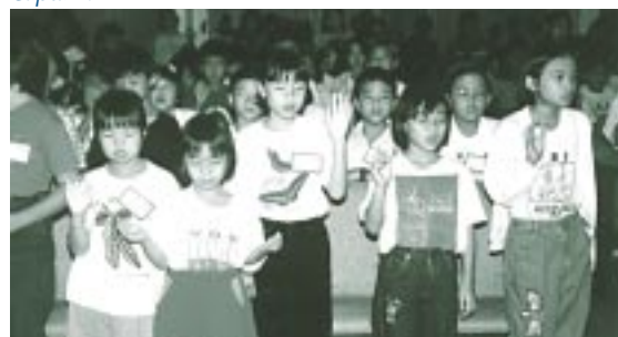
While some were praying for salvation and the baptism in the Holy Spirit at the altar, the rest of the children were encouraged to pray and worship at the pews