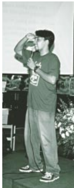
For the last time, "Come along with me on this great adventure..."