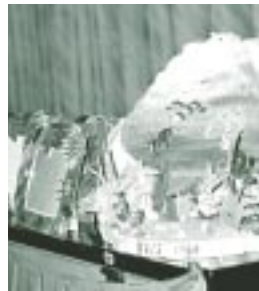
Samples of the handicraft