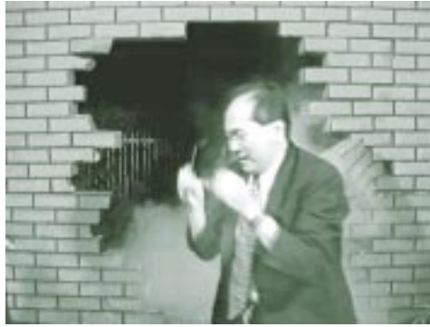
"Warning! Do not try this stunt at home!!!"