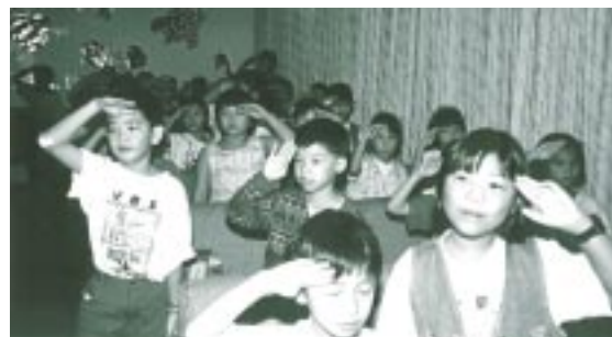
The four to seven year olds declaring that "Jesus is their Captain!"