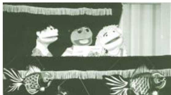
The younger children enjoyed daily puppet shows