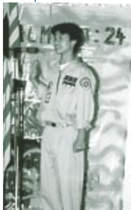
Leading the pledge