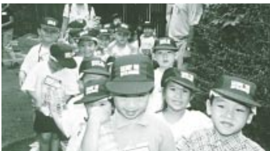
Looking forward to the outing for the day!