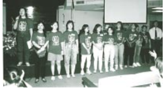
The hardworking and dedicated Committee!