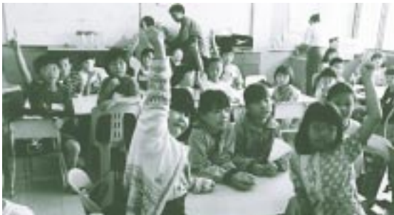
Eagerly participating in quizzes