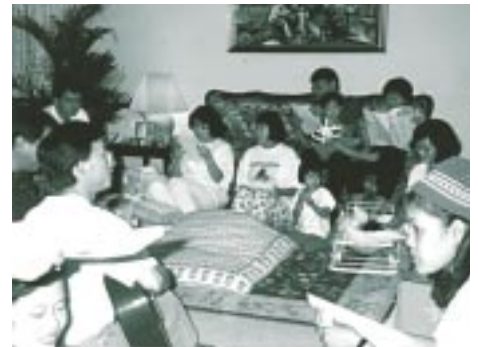
A Life Group meeting in session

Numerous testimonies were shared by individuals during the New Year's Service, of how they have been blessed through belonging to a Life Group. If you have not been to a Life Group, let 1999 be the year where you can receive help in this vital area of maturing in the Lord together with fellow believers. 🙏