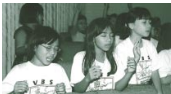
The eight to thirteen year olds reaching out to the Lord in the Sanctuary