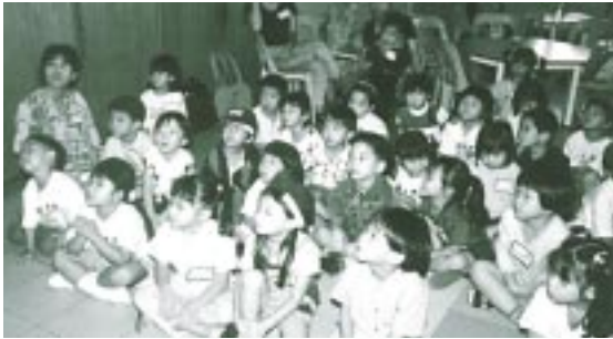
Totally engrossed in the lesson

At about 10am each morning, the children went to their respective classes according to their age groups. The routine before lunch break was morning tea break, Bible lessons and Workbook assignments. The children enjoyed the lessons that were based on the VBS theme. The objective of the lessons was to help the children discover the wonders of the sea and to understand the great value of God's salvation and promises and to accept them as priceless gifts and treasures. After lunch, the children enjoyed a time of creativity and fun during the handicraft sessions, making pencil holders, paper bags, memory verse books, picture frames and calendars using pictures of sea creatures as decorations.