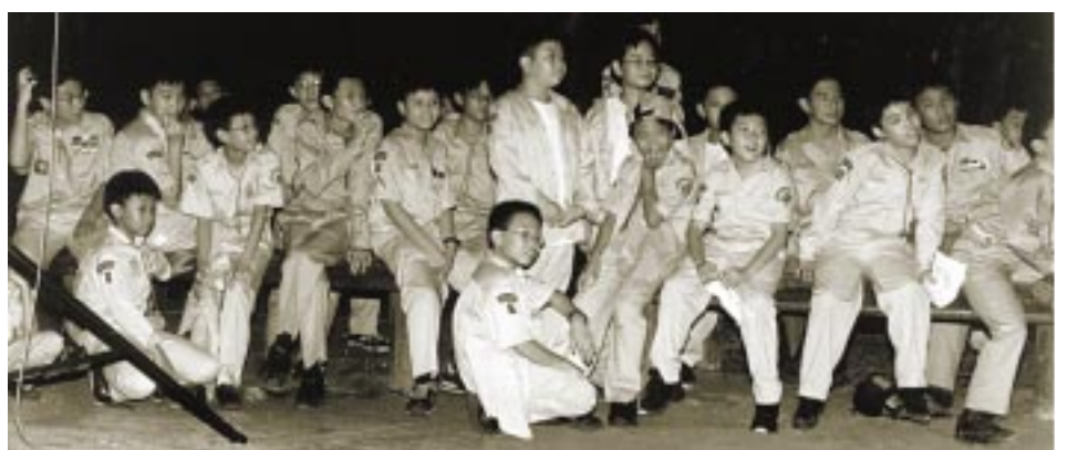
The Rangers ready to present their skits