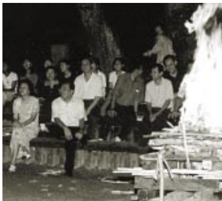
Enjoying the programme around the Council of Fire