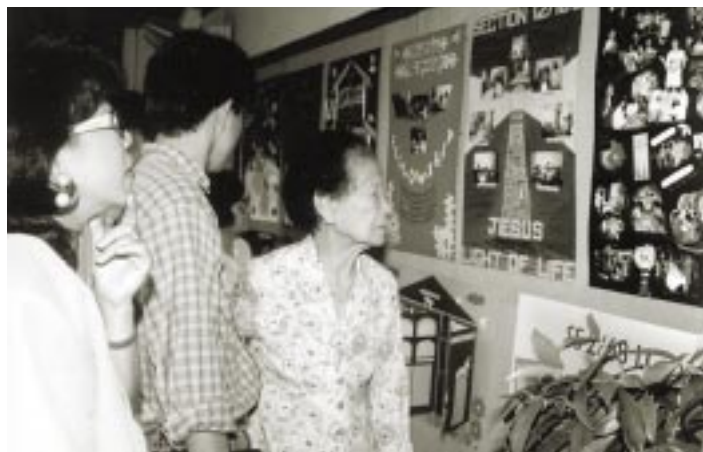
Posters, posters everywhere at Calvary Church Damansara Heights and everyone with a friendly invitation to join their fellowship...