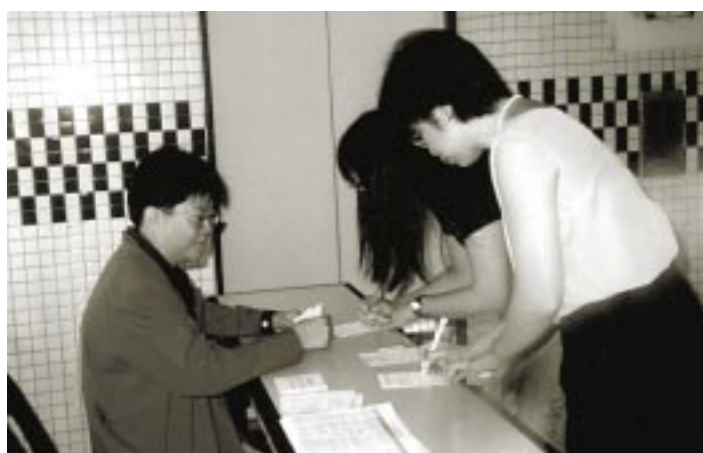
At Calvary Church Cheras...signing up to join a LG nearest home!

Below are some of testimonies of people who have been blessed in the LG: