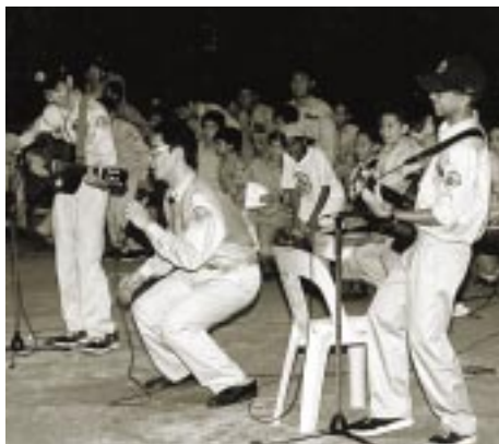
"Come on everybody..."