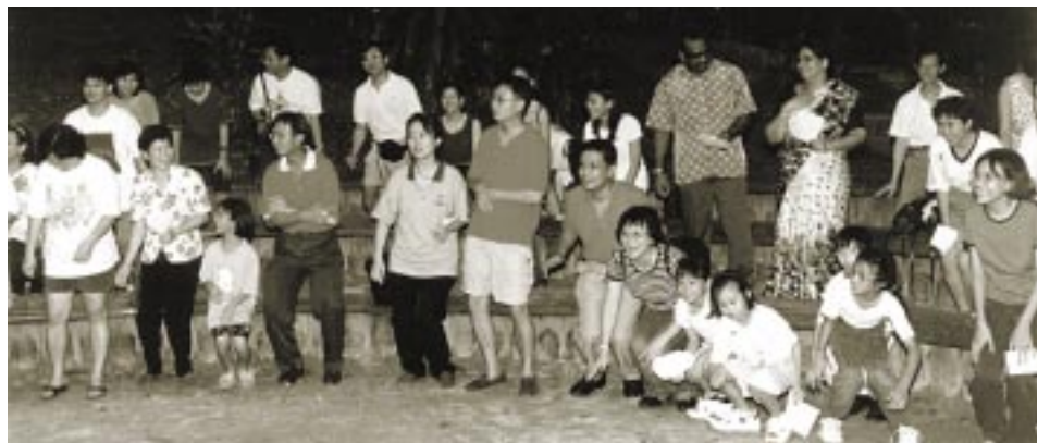
Sporting parents and friends oblige