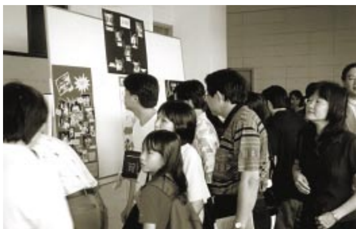
More invitations and choices at Calvary Church Bandar Utama