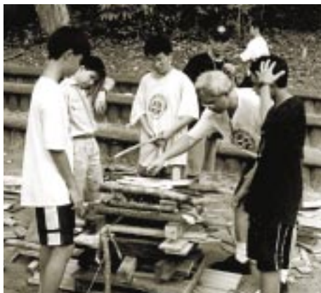
"This is how you build the Council of Fire"

The occasion started off in the afternoon with the parents and Rangers scouring Taman Pertanian Bukit Cahaya, Sri Alam in a mind-boggling scavenger hunt. They also played some telematches and had a refreshing dip in the pool.