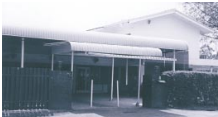
Prayer Tower at Jerusalem Bungalow, 4 Jalan Damansara Endah