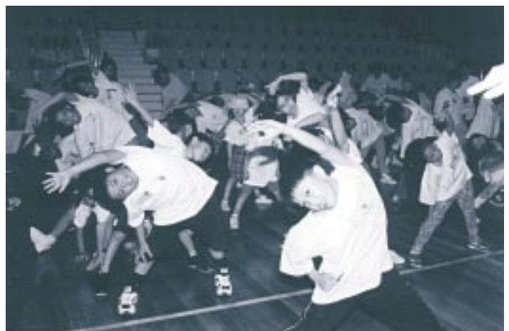
"And...stretch, two, three, four"