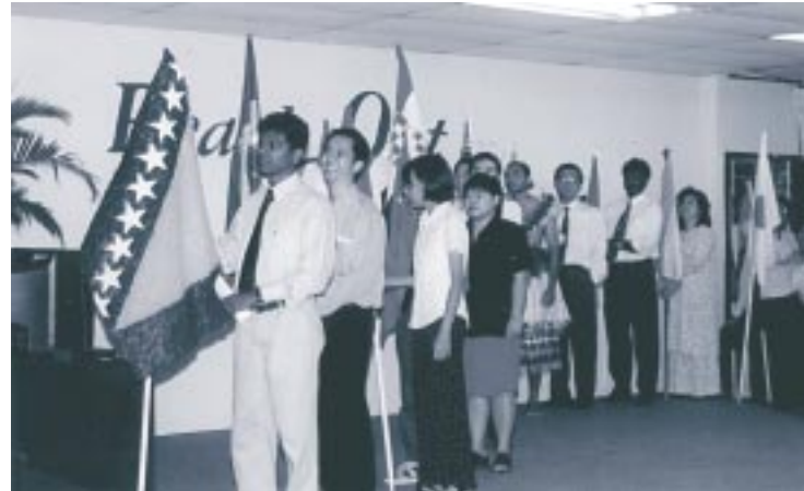
Part of the flag parade