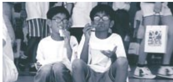
"All that exercise made us hungry"

Sun visors, a regular item of the attire of the participants of past Family Days were noticeably missing this year as all the telematches were held in the cool comfort of the covered and air-conditioned stadium. The games for the adults and children were carried out simultaneously. Each team fielded different members