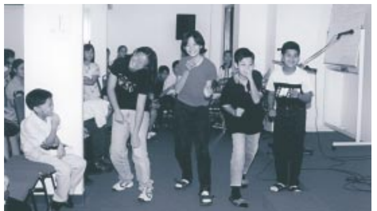
Actors and audience enjoying the "Parable of the Sower"

video of how the Faith Promise giving by the Church is being used to help others. We then renewed our Faith Promise pledges before going back to our different classes for a time of fellowship and eating! We thank God for blessing us with a wonderful day. Thirty-two children accepted the Lord Jesus Christ that day and a total of 517 children committed themselves to be partners in the Faith Promise programme! 🙏