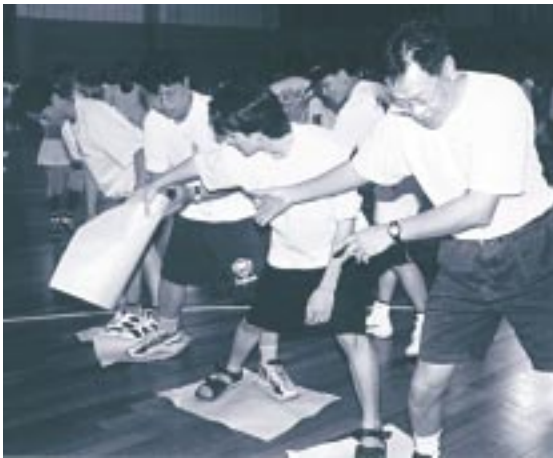
"Quick, quick, quick! I'm ready for the next paper!"

"Hope they don't throw the balls at me instead" for the various games so that everyone had an opportunity to participate. The team leaders made many attempts to get their respective teams to cheer the contestants. Sporadic "Mexican waves" were seen accompanied by loud cheers. One team almost brought the stadium down with their enthusiastic and loud stomping! Everyone, from the children to the senior citizens was caught up with the excitement of the games.