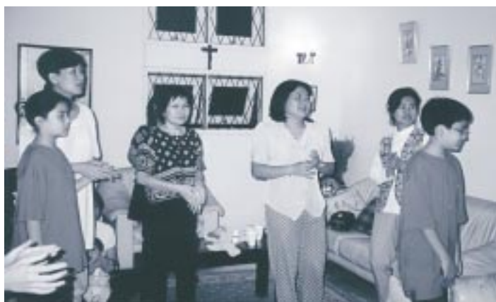
Come let us sing unto the Lord!

We are at the 11th hour before Jesus comes. Every day, hour and minute is precious. The Church needs to mobilise every believer to play an active role in the body of Christ. LG ministry provides you various opportunities for involvement and service. Make that decision today to enrol in the service of the King of Kings. The first step is to join a LG. 🙏