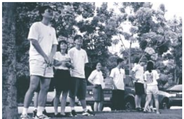
"God took from here to give first man assistance." Now, what could this be?