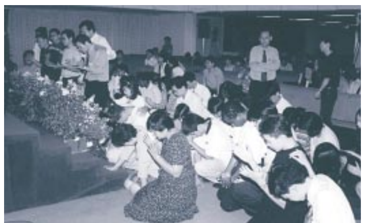
Youth, parents and other adults responding at the altar