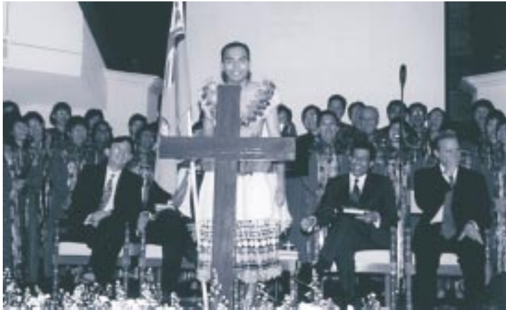
The flag bearer of Fiji decided to dress up like our island brethren!