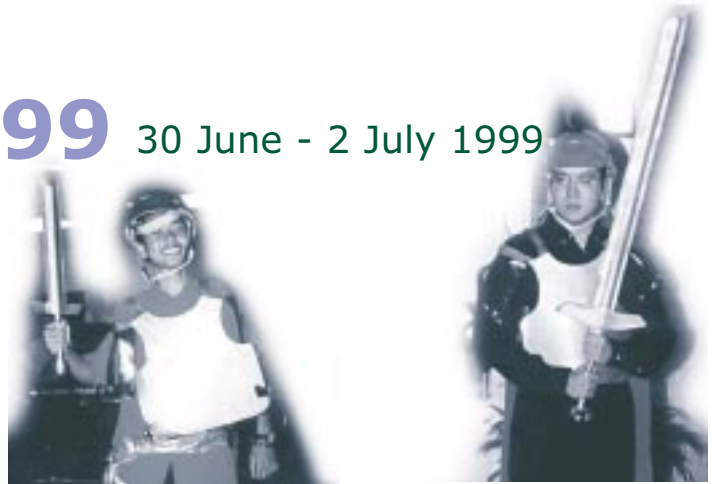
"Yuan Flung" (David) versus "Ten Men Hi" (Goliath)