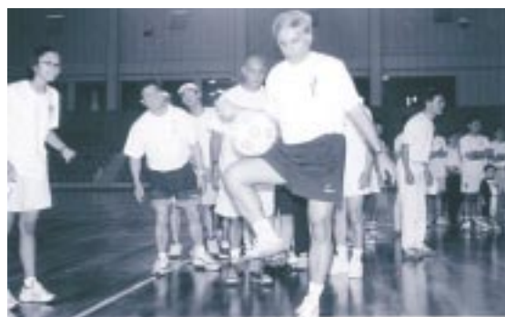
"Hey trust me! I am sure I can do this."