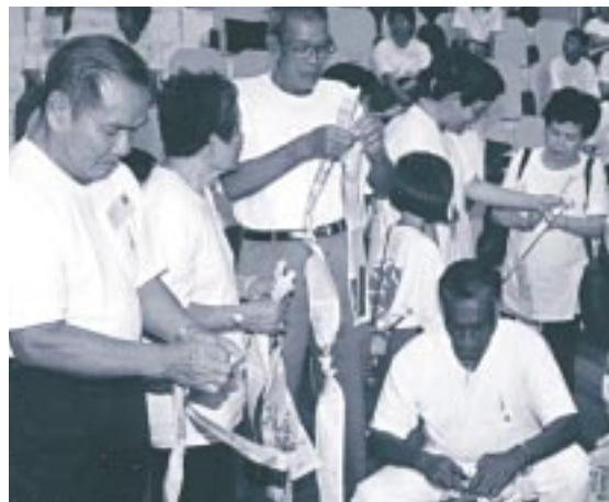
Golden Eagles making paper chains