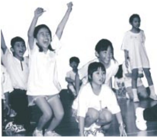
"Yeaaahhh, go for it!!!"