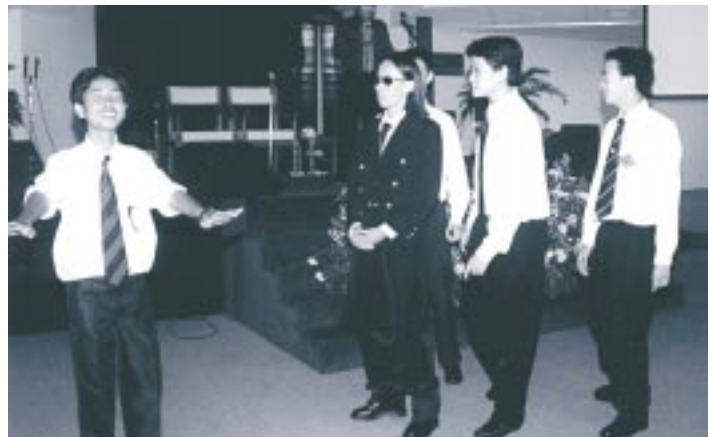
Trench-coated "Jesus" healing the blind man