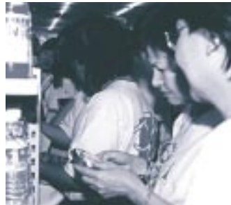
"Hmm...wonder if this is the right noodle"