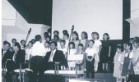
The CW children singing to the fathers