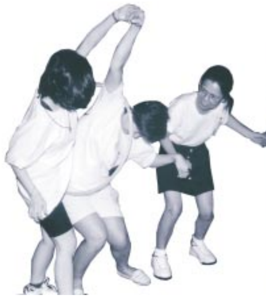
"Help! I think I'm stuck!"