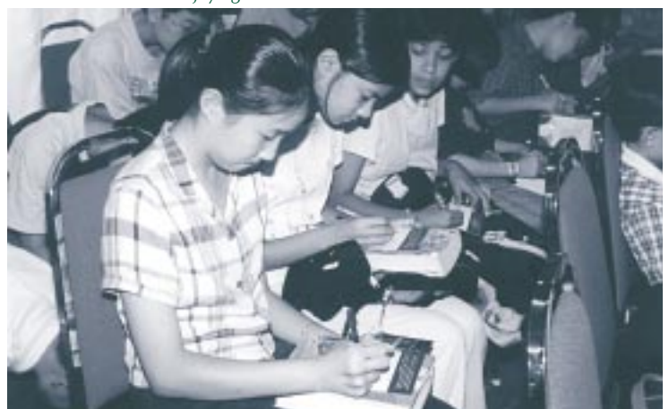
Carpenter's Workshop children making their Faith Promise pledges