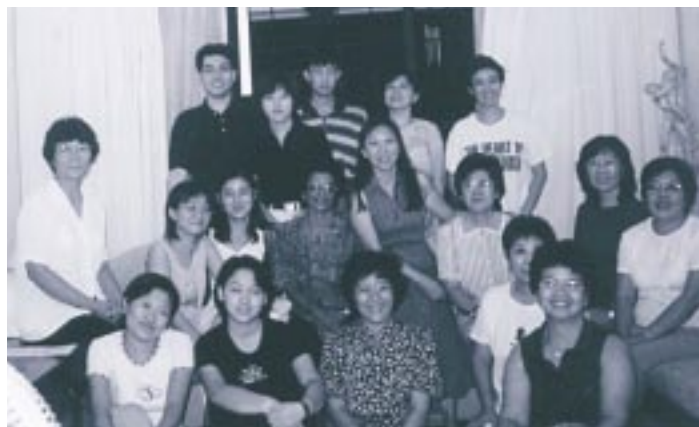
Belonging to a big family

If this is how you feel, then perhaps you should dwell more on the second question. Ask yourself: What can I do to be a blessing to the LG ministry? Will my musical talents help? Can my contribution in the discussion direct others to God? Will my prayer for a fellow member encourage him? Will my testimony of God's goodness lift the spirits of others? Can my sheer presence in the LG meeting be a blessing to someone? Can I be a supportive friend to someone?