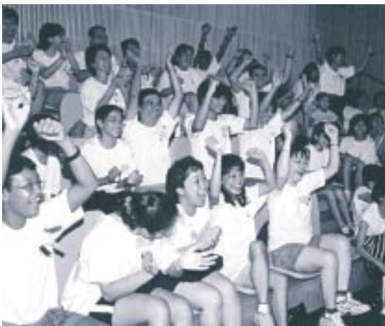
"Come on Blue!!!"