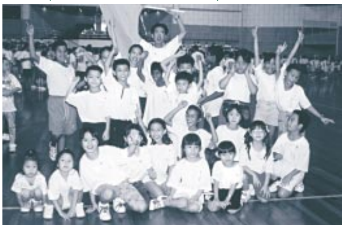
"We are the champions!" The Yellow Team—first in the Children's telematches